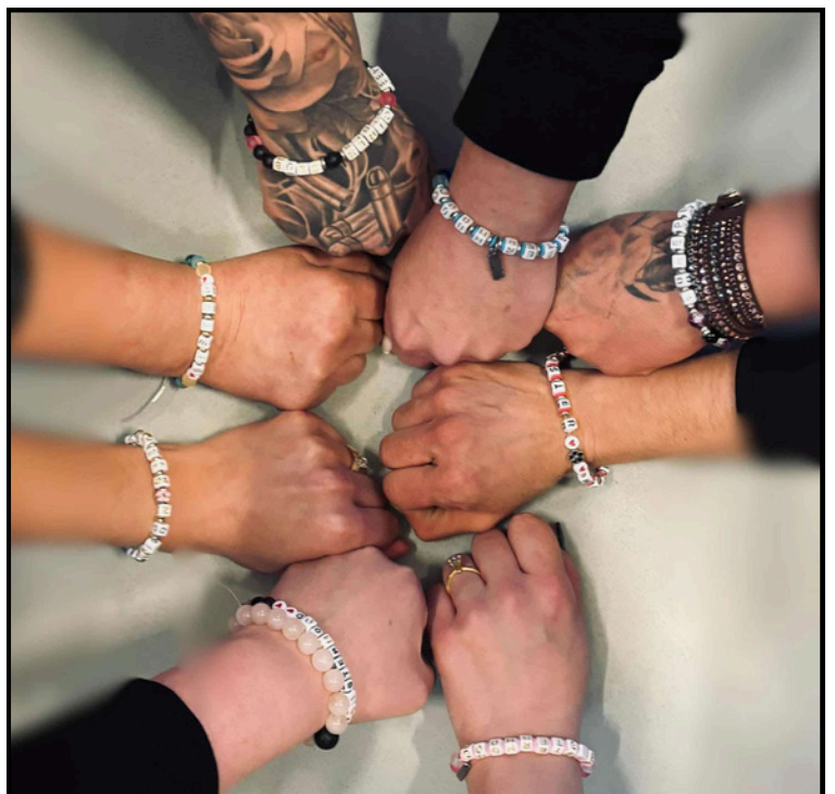
Women's Committee posing with wristbands made at the AFL Remembrance Event.

Being able to share my day with my dad. Having him be able to give me advice and share his stories. Also reconnecting with past crews to reminisce about old jobs.