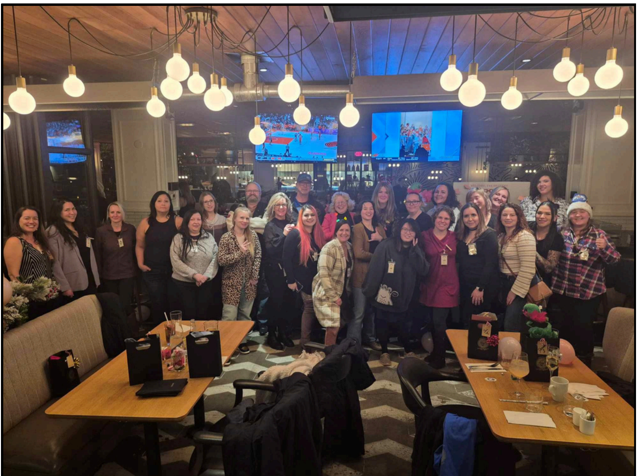
23 Sisters were in attendance at the Women's Committee Dinner Event