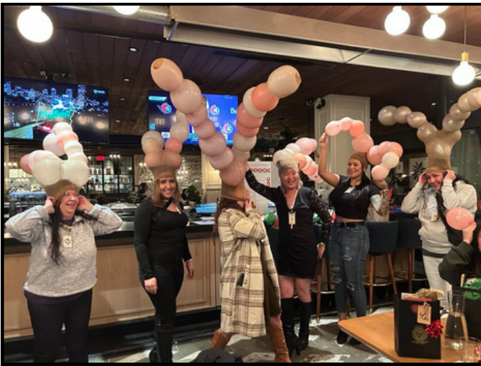
Fun and Games at the Women's Committee Dinner Event

Here's to the incredible memories we've made and the connections that continue to grow.